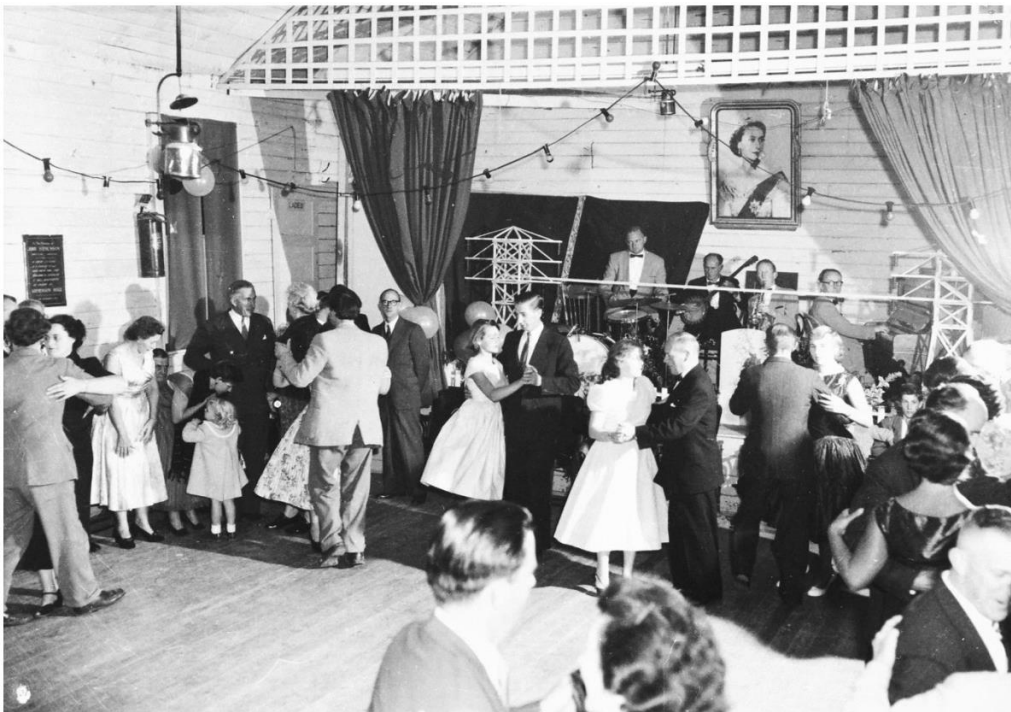
A Ball was organised to celebrate the turning on of electricity in Kangaroo Ground on 10 th April 1958

Reproduced from the authors of 'These Walls Speak Volumes' A History of Mechanics Institutes in Victoria.